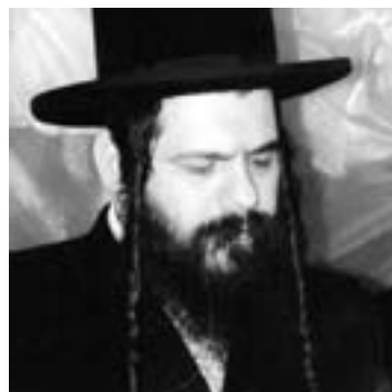
The Koidenover Rebbe to visit the Five Towns, Parashas Va'eira. See Page 37