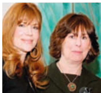
Bikur Cholim of Far Rockaway/Five Towns. See Page 66